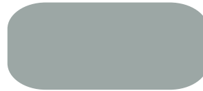
DOVE GREY (13)*