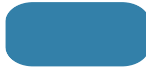
SIAM BLUE (14)