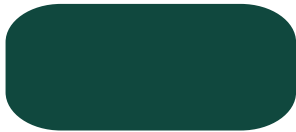
FOREST GREEN (11)*