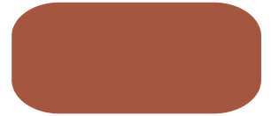
MISSION RED (08)