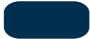
REGAL BLUE (18)