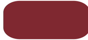
BRITE RED (17)