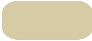
CONCORD CREAM (05)*