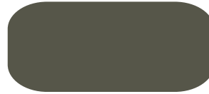
MEDIUM BRONZE (03)*