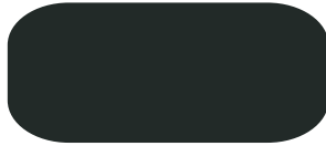
CLASSIC BRONZE (01)*