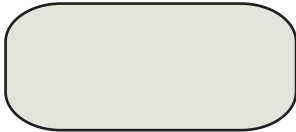
BONE WHITE (26)*