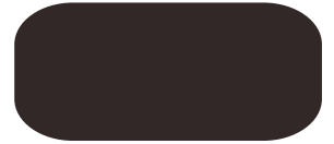
CHOCOLATE BROWN (04)