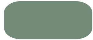
PATINA GREEN (12)